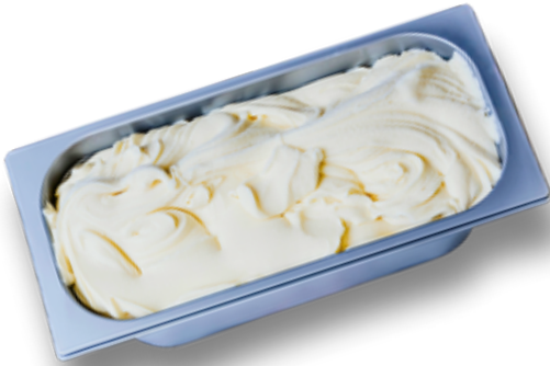
Base Mix AL-GEL003

Unflavoured gelato Base – ideal for milk shakes