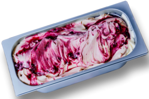
Amerena cherry AL-GEL001

Amarena Cherry flavoured gelato marbled and topped with Amarena Compote