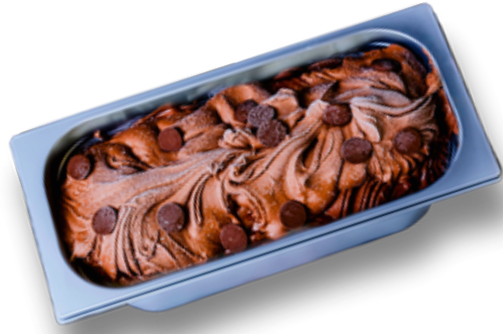
Belgian Chocolate AL-GEL004

Unflavoured gelato Base – ideal for milk shakes