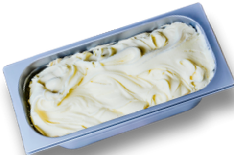
Natural Yogurt AL-GEL018

Plain flavoured gelato marbled and topped with Nutella