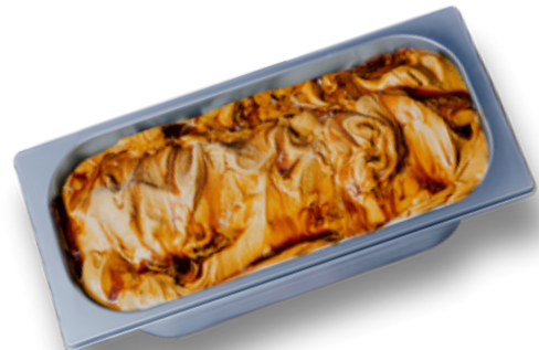
Salted Caramel AL-GEL024

Caramel flavoured gelato marbled and topped with Salted Caramel